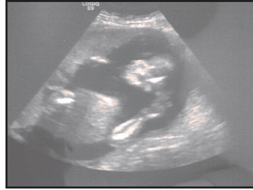
This is the baby we just placed in a Sponsor Family. While he's growing in mom, she can experience the growth she needs in the safety of their new home.

Oh what an amazing year! God has once again proven that He can and does meet our needs. With your help, Bethany House has served over 25 family members this past year. Our ministry has expanded with the use of sponsor families, all of which are now full to capacity following the placement of our newest mom-to-be. We've provided services not only to pregnant women and single moms with children, but have also helped parents, grandparents, and friends find resources and provided the counseling needed to help them help the wounded women in their lives. What an awesome experience to see families changed as they learn how to support their loved ones through such difficult circumstances. We need more sponsor families to join our mission. We hope the stories shared in this newsletter will inspire you this Holiday Season. We at Bethany House wish you a Merry Christmas and a happy New Year. Let's make 2011 another year to remember. God bless you!