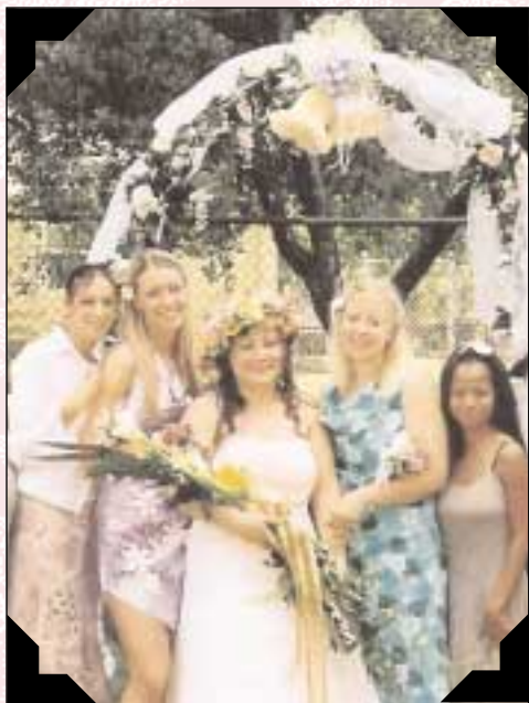
Former Bethany House Residents