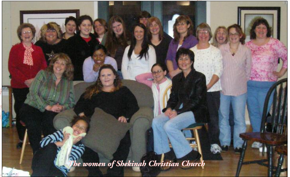
The women of Shekinah Christian Church